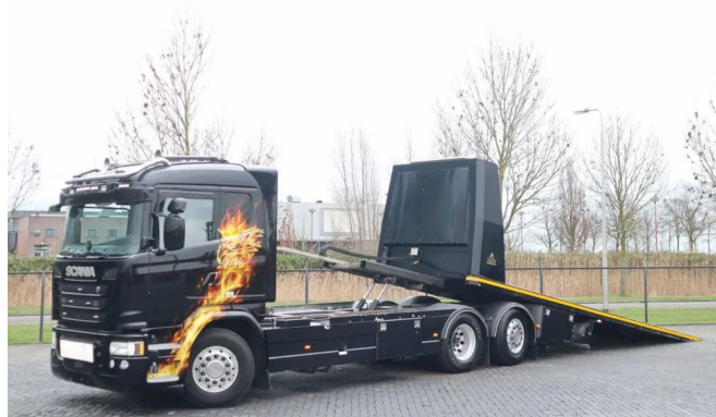
Scania G490 6X2 | FALKOM | RECOVERY | ABSCHLEPP | ...