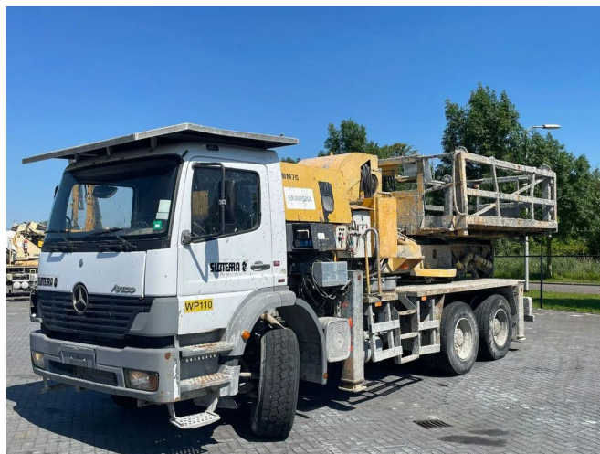
Mercedes-Benz Atego 2628 6X4 FULL STEEL MANUAL HUB...