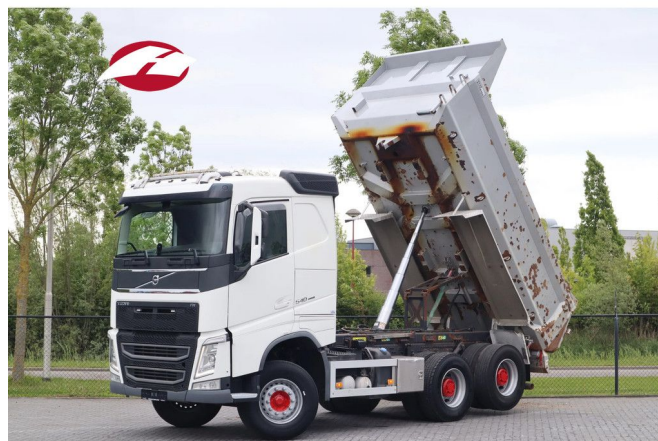
Volvo FH 540 | 6X4 | TANDEMLIFT | RETARDER | BIG AXL...