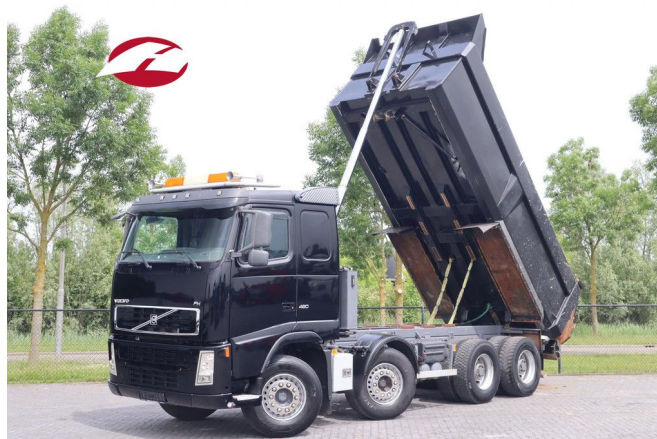
Volvo FH 480 | 8X4 | FULL STEEL | BIG AXLES | EXCELLE...