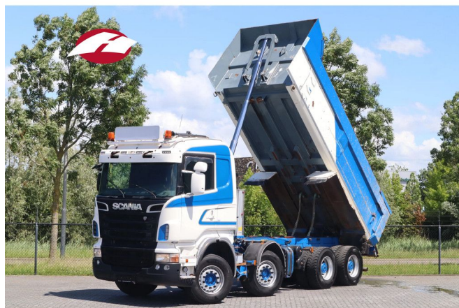
Scania R500 V8 | 8X4 | RETARDER | FULL STEEL | BIG AX...