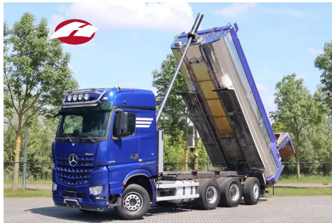
Mercedes-Benz Arocs 3658 | 8X4 | RETARDER | BIG AXLES ...