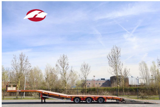
Max Trailer MAX 100 | 3-AXLE | LIFT DECK | SLIDING RAMPS