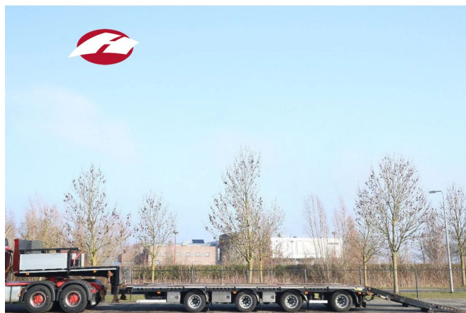
Istrail 4-AXLE SEMI-TRAILER | HYDR RAMPS | HYDR WID...