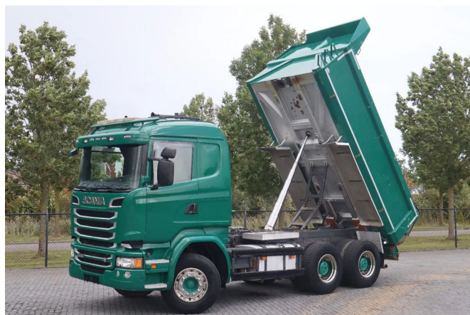
Scania R580 V8 | 6X4 | FULL STEEL | BIG AXLES | RETARD...