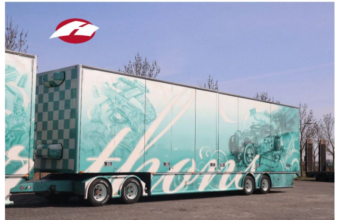
Ovriga Limetec FULL SIDE OPEN TRAILER | 2 AXLE DOLLY ...