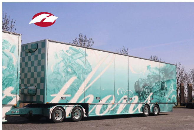
Ovriga Limetec FULL SIDE OPEN TRAILER | 2 AXLE DOLLY ...