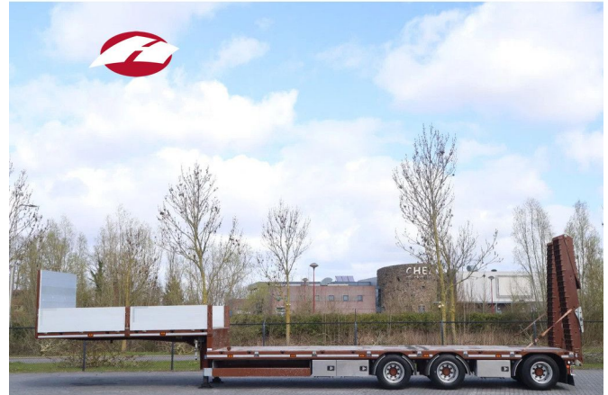
HRD STLM 3N | 3-AXLE | SLIDING RAMPS | STEER & LIFT ...