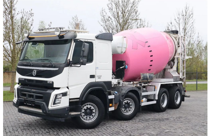
Volvo FMX 500 | 8X4 | INTERMIX 10M3 | FULL STEEL | BIG ...