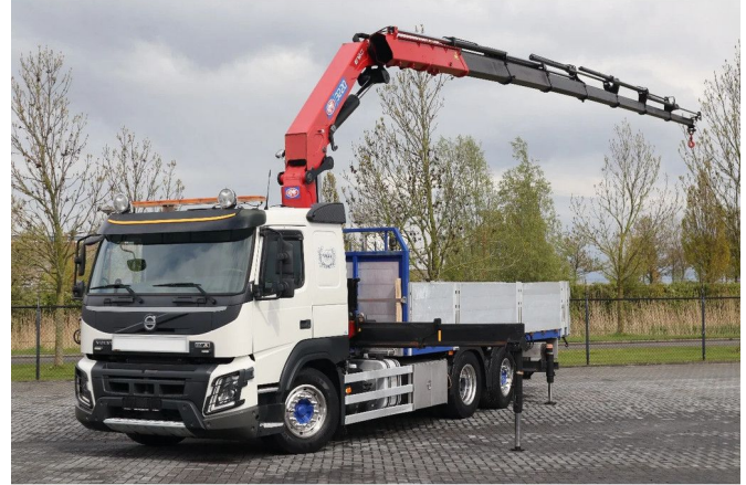
Volvo FMX 500 6x2 HMF 3220 K7