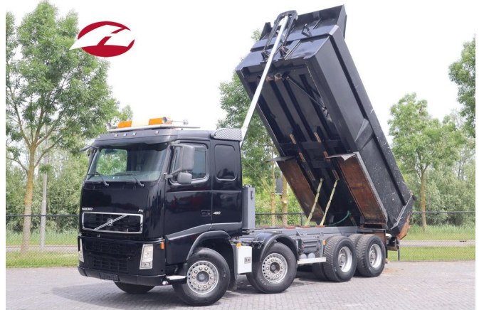
Volvo FH 480 | 8X4 | FULL STEEL | BIG AXLES | EXCELLE...