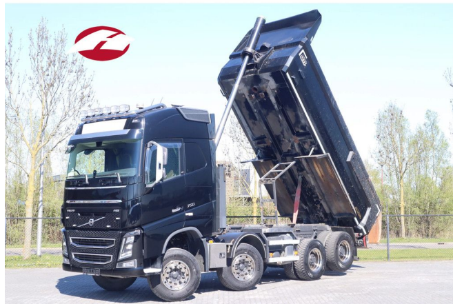
Volvo FH 16.750 | 8X4 | TANDEM LIFT | RETARDER | EURO 6