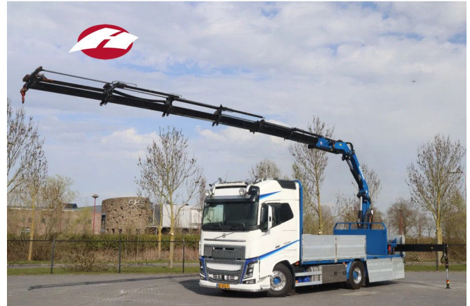
Volvo FH 16.750 | 6X2*4 RETARDER EFFER 215-6 DEMOU...