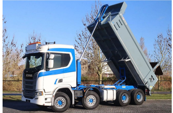
Scania R580 V8 NGS | 8X4 | RETARDER | EURO 6 | BIG AX...