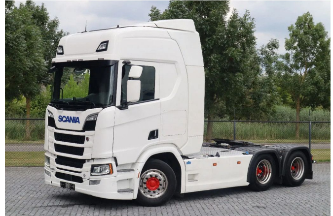
Scania R580 V8 NGS | 6X4 | RETARDER | HYDRAULICS | 66...