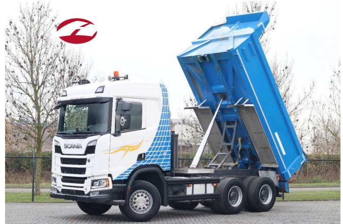
Scania R580 V8 NGS 6X4 | FULL STEEL | RETARDER | EU...