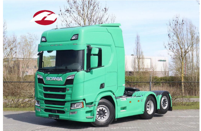
Scania R580 V8 NGS 6X2 | RETARDER | HYDRAULICS | E...