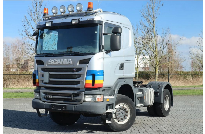
Scania G440 4X4 EURO 5 RETARDER HYDRAULIC