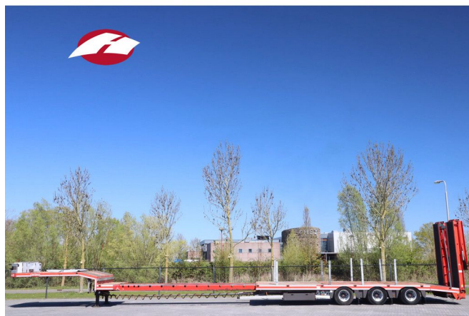
Nooteboom OSDS-48-03-V | 6-MTR EXTENSION | WINCH | ...