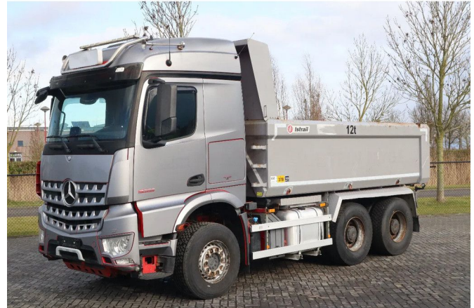
Mercedes-Benz Arocs 2658 2858 | 6X4 EURO 6 BIG AXLES | ...