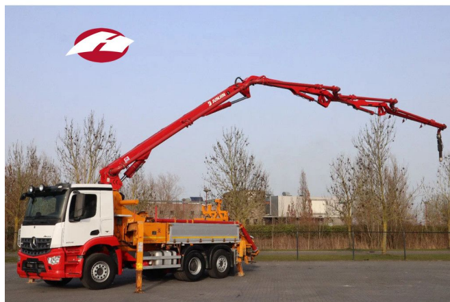
Mercedes-Benz Arocs 2546 6X2*4 | JUNJIN 25 METER | RE...