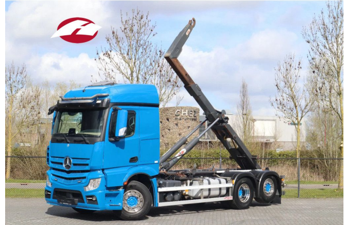
Mercedes-Benz Actros 2653 6X2 | RETARDER | HYVA HOOK...