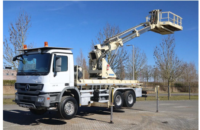
Mercedes-Benz Actros 2636 6X4 | TUNNEL PLATFORM | R...