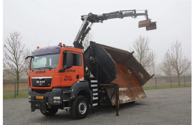
MAN TGS 33.440 6X6 | 2 SIDE TIPPER | ATLAS 165.2 | GR...