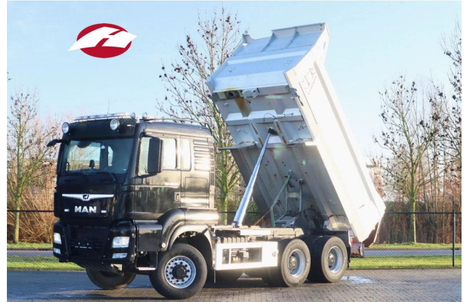
MAN TGS 26.500 6X4 | 6X6 | HYDRODRIVE | BIG AXLES | ...