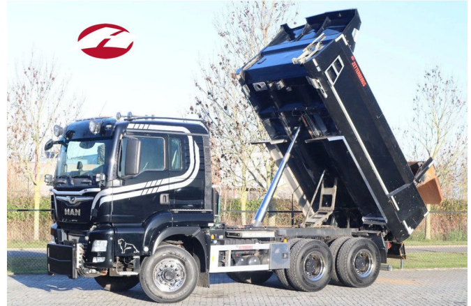
MAN TGS 26.500 6X4 | 6X6 | HYDRODRIVE | 188.000 KM | ...