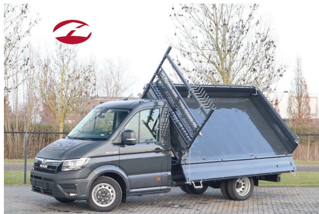
MAN TGE 6.160 | 4X2 | 3-WAY MEILLER | UNUSED