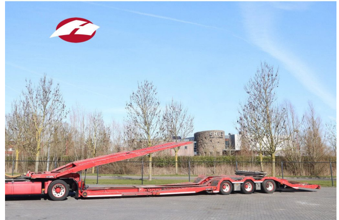
GS Meppel O-120-2400 TRU O-120-2400 | TRUCK TRANS...