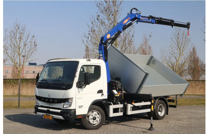
FUSO Canter 7C18 | 4X2 | 3-WAY TIPPER | PM 6.5 KRAN /...