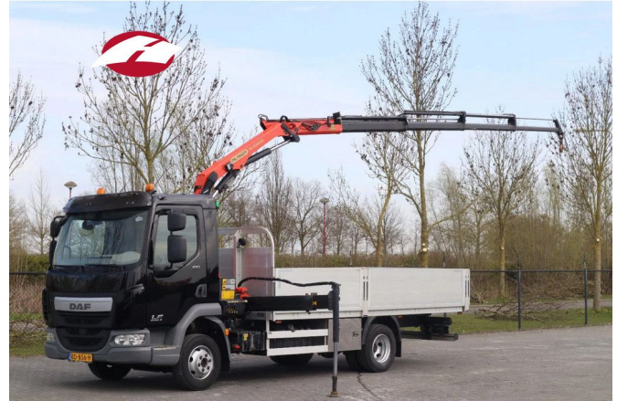
DAF LF 210 | 4X2 | PALFINGER PK5001 | REMOTE | 48.000...