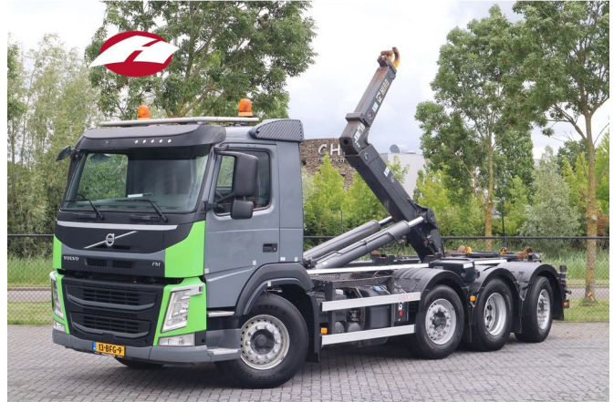
Volvo FM 420 | 8X2*6 | HIAB HOOKLIFT | 26 TON | EURO 6