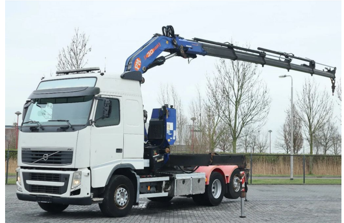
Volvo FH 500 EURO 5 CABLE/CRANE PM 30