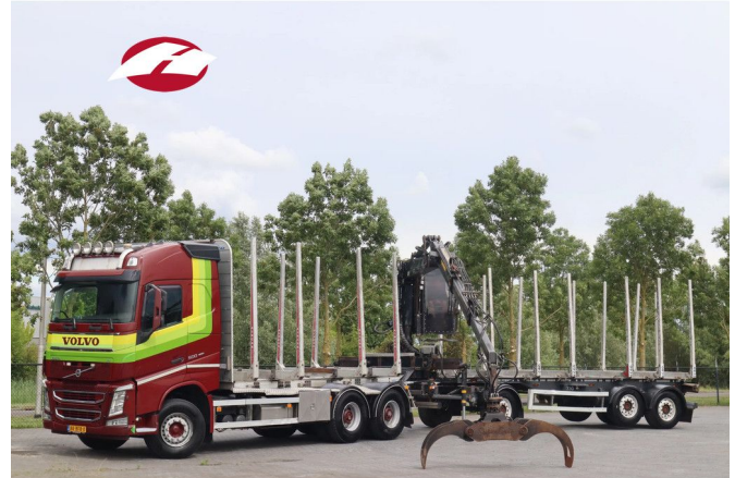
Volvo FH 500 | 6X4 | HIAB 140ST | ALUCAR | 3-AXLE TRAILER