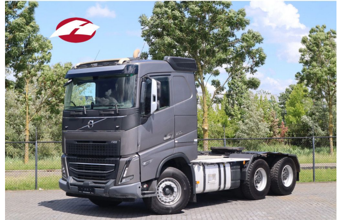
Volvo FH 16.750 | 6X4 | 100 TON | FULL STEEL | RETARD...