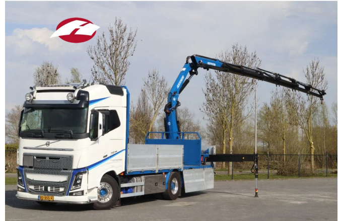
Volvo FH 16.750 | 6X2*4 RETARDER EFFER 215-6 DEMO...