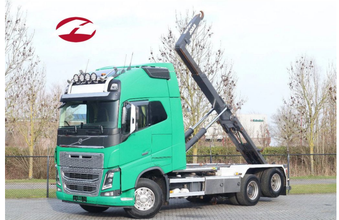
Volvo FH 16.750 6X2 | RETARDER | JOAB HOOK | EURO 6