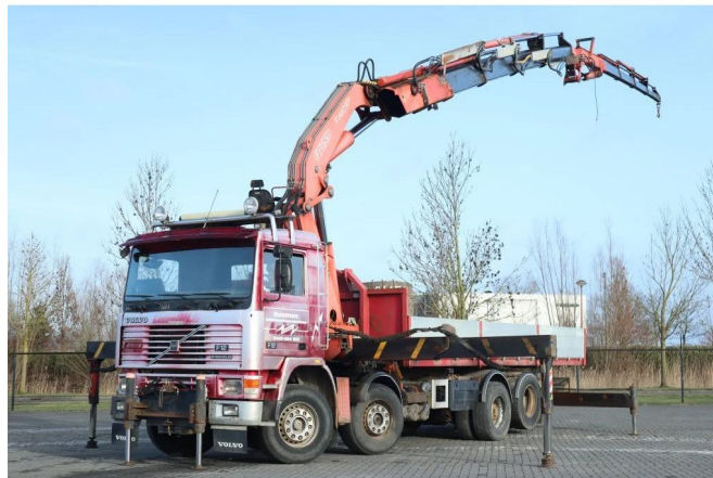
Volvo F 12.400 8X2 FASSI F600XP.24 WITH JIB