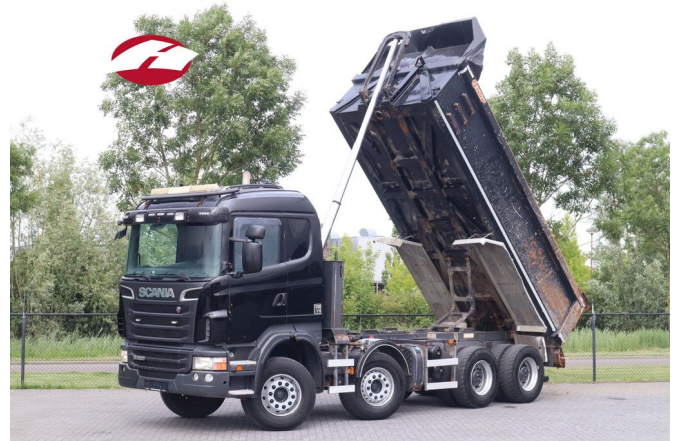
Scania R620 | 8X4 | RETARDER | FULL STEEL | BIG AXLES...