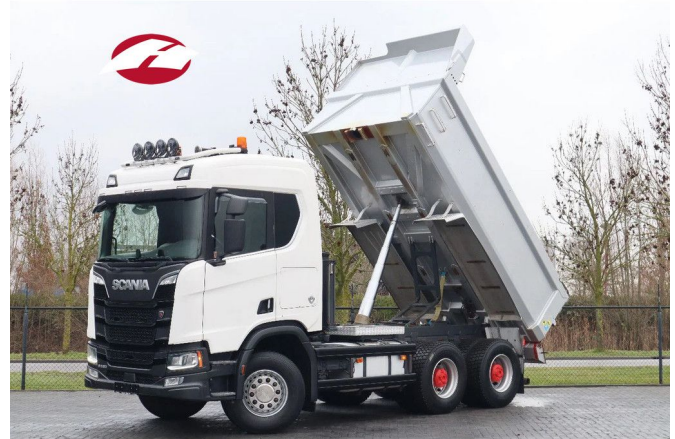
Scania R580 V8 NGS | 6X4 | FULL STEEL | RETARDER | E...