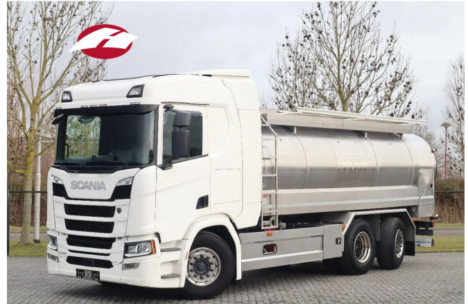
Scania R540 NGS | 6X2*4 | RETARDER | ISOLATED | 15.00...