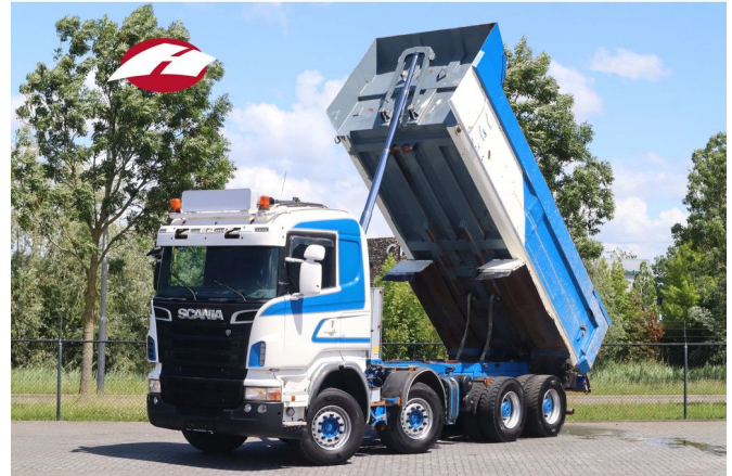
Scania R500 V8 | 8X4 | RETARDER | FULL STEEL | BIG AX...