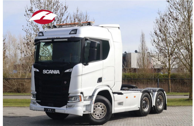
Scania R500 NGS 6X4 | RETARDER | BIG AXLES | HYDRA...