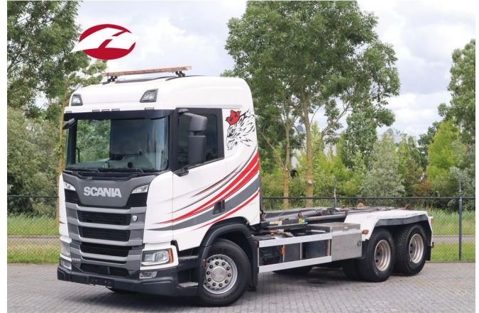
Scania R500 NGS 6X2 | RETARDER | JOAB HOOK | EURO 6