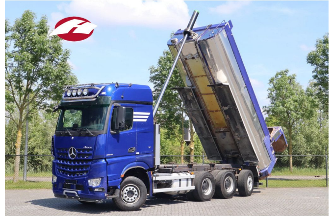
Mercedes-Benz Arocs 3658 | 8X4 | RETARDER | BIG AXLES ...