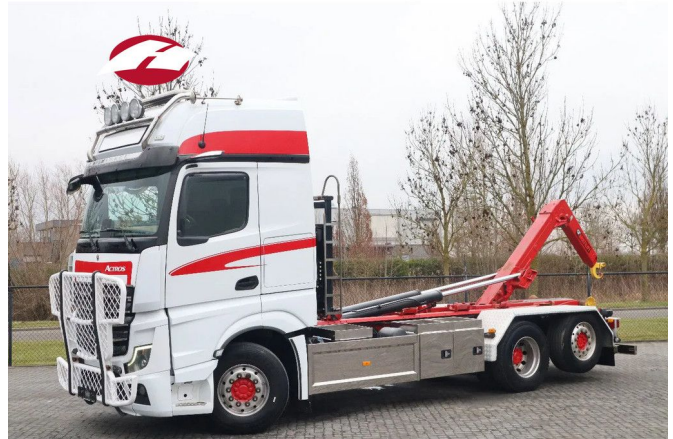
Mercedes-Benz Actros 2563 | 6X2 | MULTILIFT HOOK | RET...