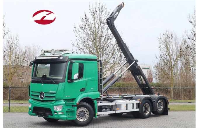
Mercedes-Benz Actros 2546 | 6X2 | JOAB HOOK | RETARD...